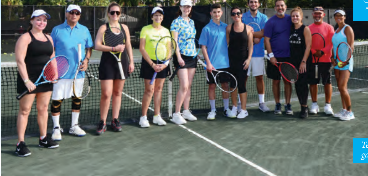
Tennis Players gather for matches.