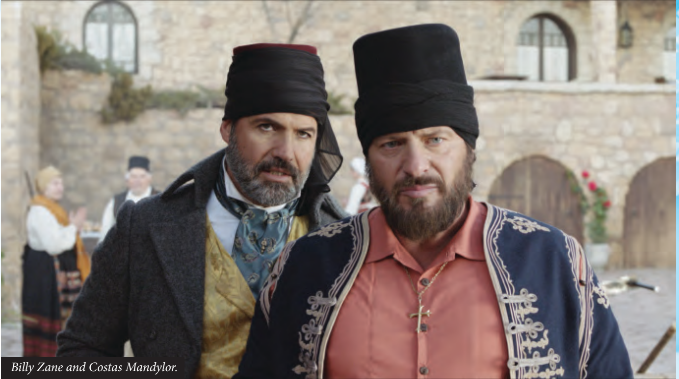
Billy Zane and Costas Mandylor.

superstition, loyalty vs. betrayal. Like in real life, our characters are layered with doubts and contradictions that make them vulnerable and human.”