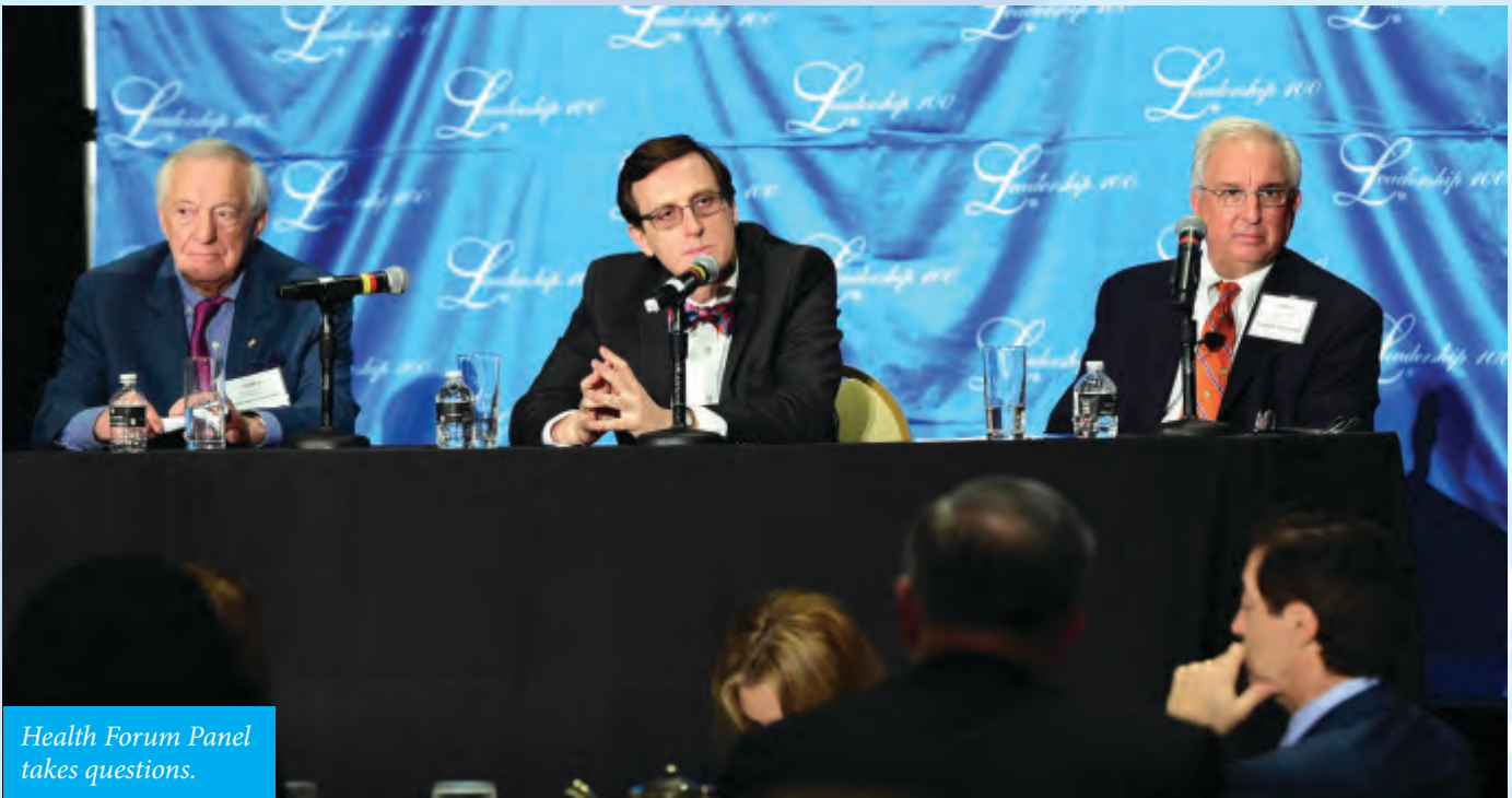
Health Forum Panel takes questions.

Medicine and the American Board of Internal Medicine (Gastroenterology). His clinical interests include: