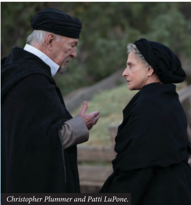
Christopher Plummer and Patti LuPone.

Can a younger generation see with better eyes than their elders, breaking free of ingrained cultural fears and biases