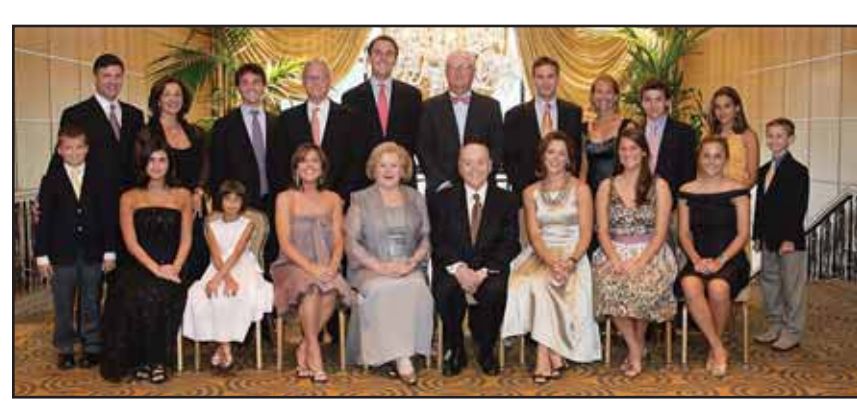
The Anton clan gathers for the celebration.