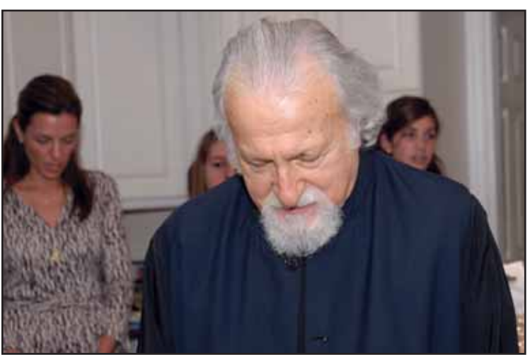
Metropolitan Isaias of Denver gives blessing at L100 luncheon.