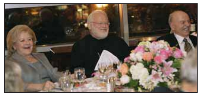
The Antons with Metropolitan Methodios of Boston.