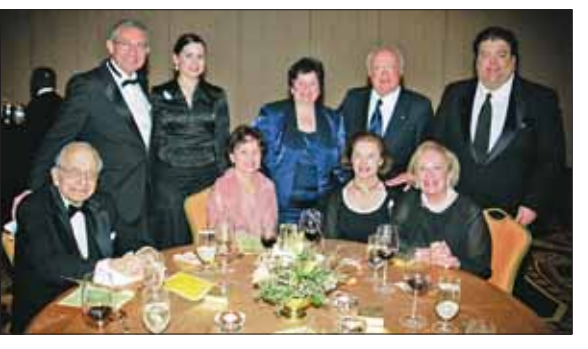
L100 members and guests at the Grand Banquet.