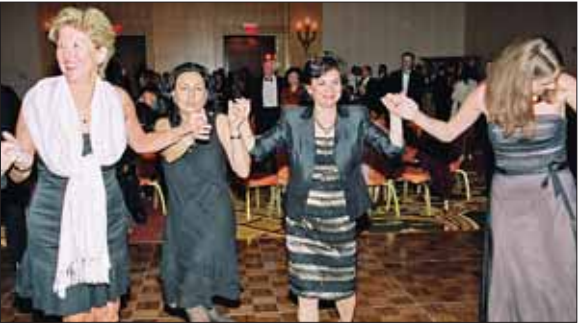
Dancing at Grand Banquet.